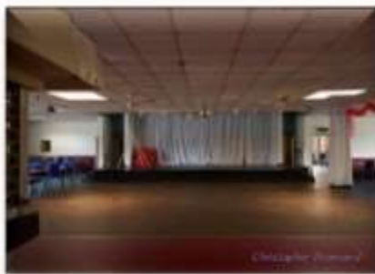
The club is also used for weddings, parties and other community celebrations. (Pictured above.)